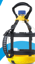
CARRYING & POURING DURAN® GL 45 BOTTLE CARRYING SYSTEM