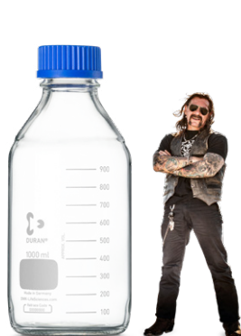
ORIGINAL DURAN® ORIGINAL GL 45

The bottles come with a comprehensive range of caps, connection systems and accessories that allow you to put together your own individual system for high-precision applications.