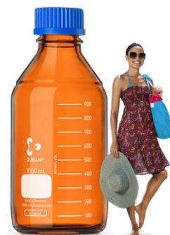
UV-PROTECTED DURAN® AMBER

Retaining the best features of the original bottle, this next-generation of laboratory bottles offers improved ergonomic features, user safety, and a dedicated system of useful components.