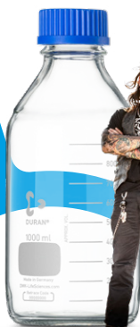
ORIGINAL DURAN® ORIGINAL GL 45