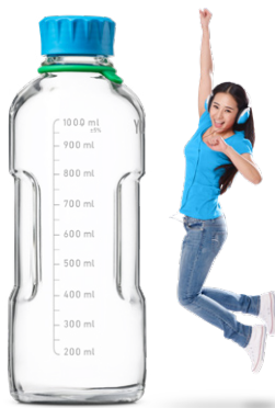
SMART DURAN® YOUTILITY®

The gold standard of multi-functional laboratory bottles made of a high-purity borosilicate glass 3.3. A combination of high-performance materials and robust design provides a long usable working life.