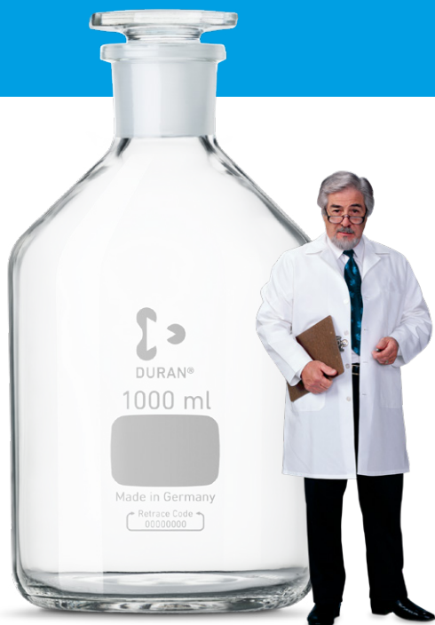
TRADITIONAL DURAN® REAGENT BOTTLE